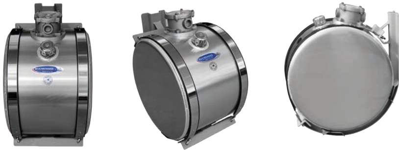
Round Hydraulic Tanks with single mount brackets and stainless steel straps.