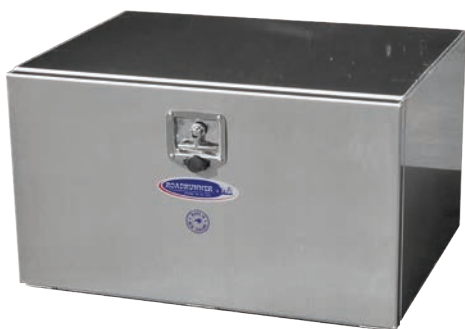
Custom Square Toolbox with single door.