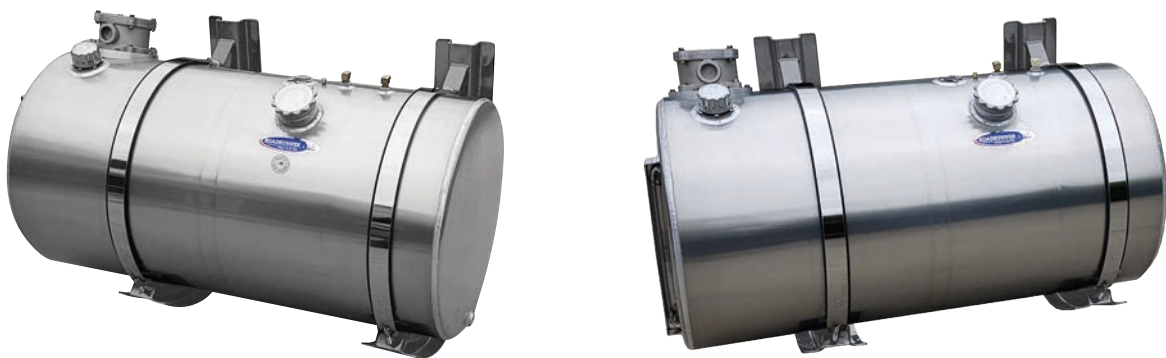
Round Combination Tank with grey brackets and stainless steel straps.