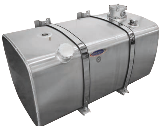
Oval Square Combination Tank with VDO, grey brackets and stainless steel straps.