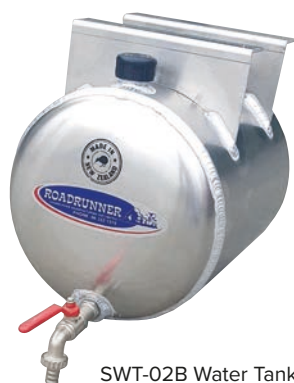
SWT-02B Water Tank.