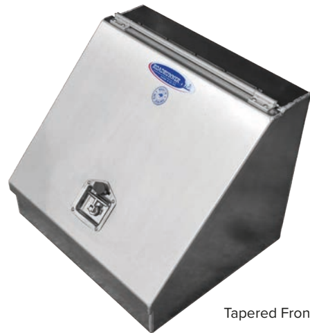
Tapered Front Toolbox.