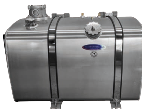
Oval Square Combination tank with pick up pipes grey brackets and stainless steel straps.