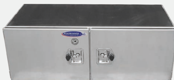
Double Door Toolbox.

Value-add: Choosing a robust, durable, New Zealand made product might enable you to hold on price for longer in terms of vehicle value or add to the sale value or sale leverage down the line.