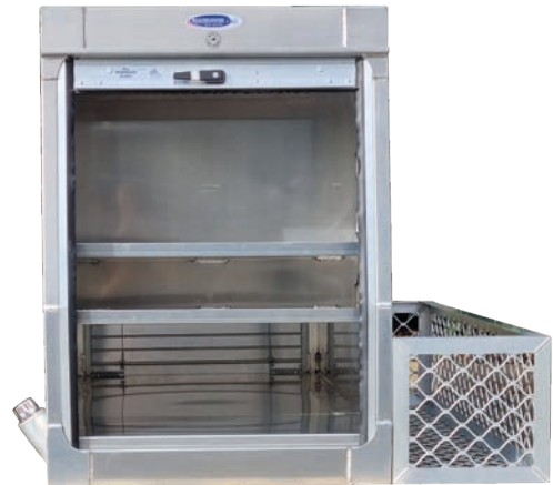
Double roller door locker box with hidden water tank and dunnage cage.