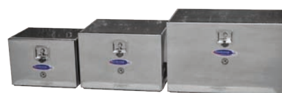
STB900, STB901 and STB902 Square Toolboxes.