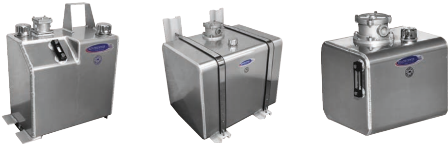
Custom Hydrualic Tank.