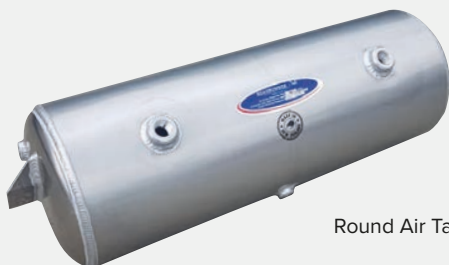
Round Air Tank with brackets.

Easy replication: Tanks can get damaged on trucks because of general usage/accidents. It can be costly because of time and import associated fees to have to replace them from overseas importers.