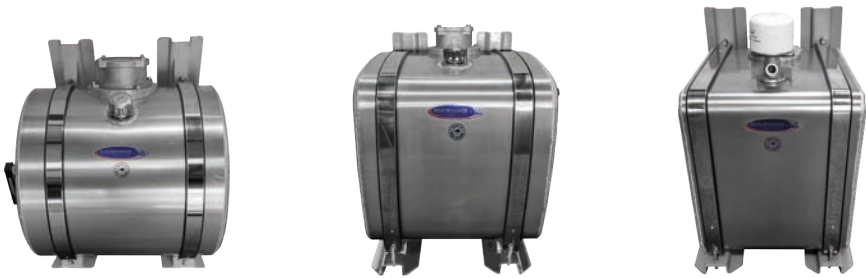
Round Hydraulic Tank with two brackets.