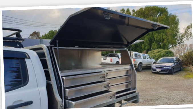
Service Box with pull out draws.

Get a quote or place order: www.roadrunnerltd.co.nz /custom-manufacturing/ute-boxes