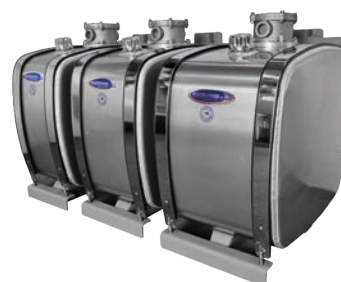
120L, 140L and 160L Oval Square Hydraulic Tanks.

*Note all Hydraulic Tanks come with a 1¼" BSP Return Line Filter, 1¼" BSP Suction Line Fitting and a Chrome Filler Breather.