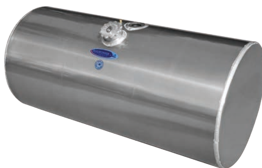
Round Fuel Tank without brackets or straps.