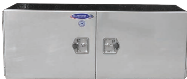
Double Door Toolbox.