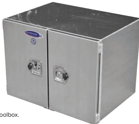
Square Double Door Toolbox.