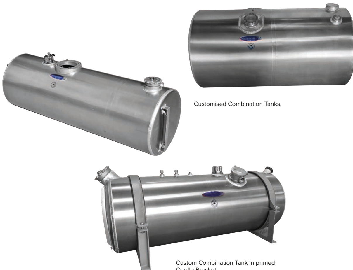
Customised Combination Tanks.