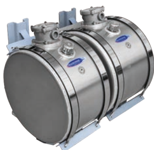
120L and 140L Round Hydraulic Tanks.