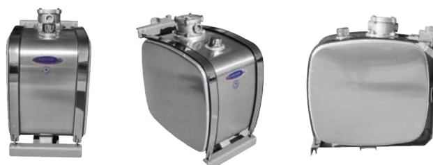
Oval Square Hydraulic Tanks with single mount brackets and stainless steel straps.