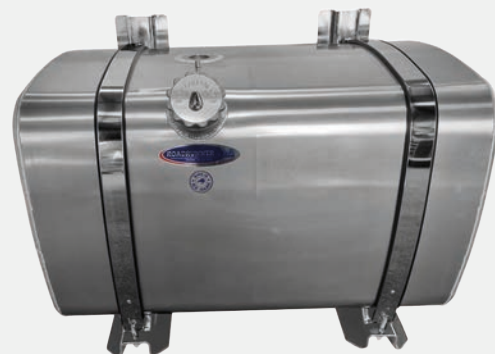
Oval Square Fuel Tank with grey brackets and stainless steel straps.

Thicker aluminium: Thicker grade aluminium means a stronger, more durable product that is less likely to dent/scuff or damage.