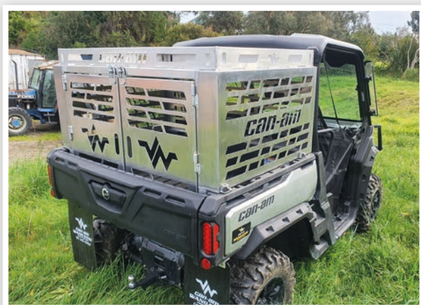
A selection of some of our custom designed dog boxes.

Weatherproof: New Zealand's weather can be treacherous. It's important that dogs are transported safely and protected from the elements as much as possible. Our New Zealand made boxes are made with New Zealand conditions in mind.