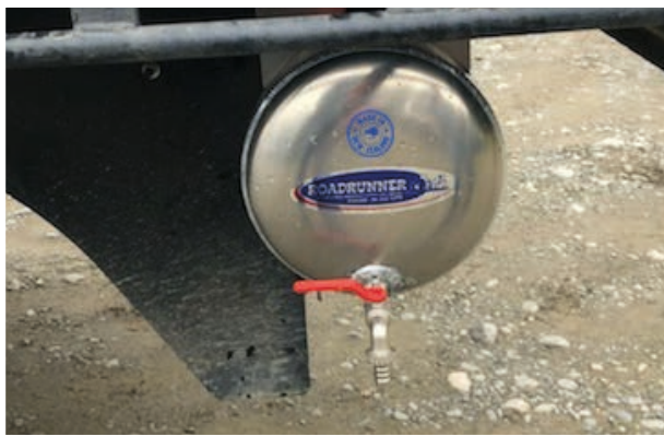
Under deck mounted Water Tank WT-02.

*Note all water tanks have brackets supplied loose.