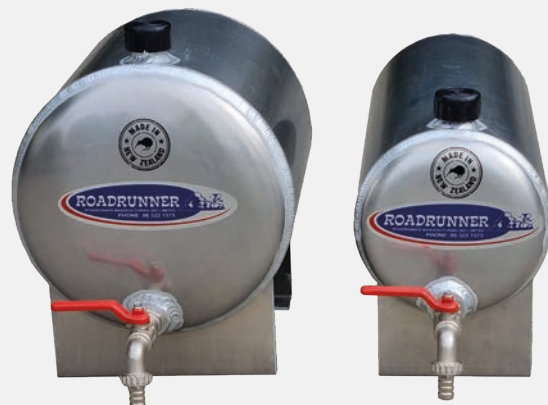
WT-02 & WT-01 Water Tanks.

Get a quote or place order: www.roadrunnerltd.co.nz /shop/water-tanks