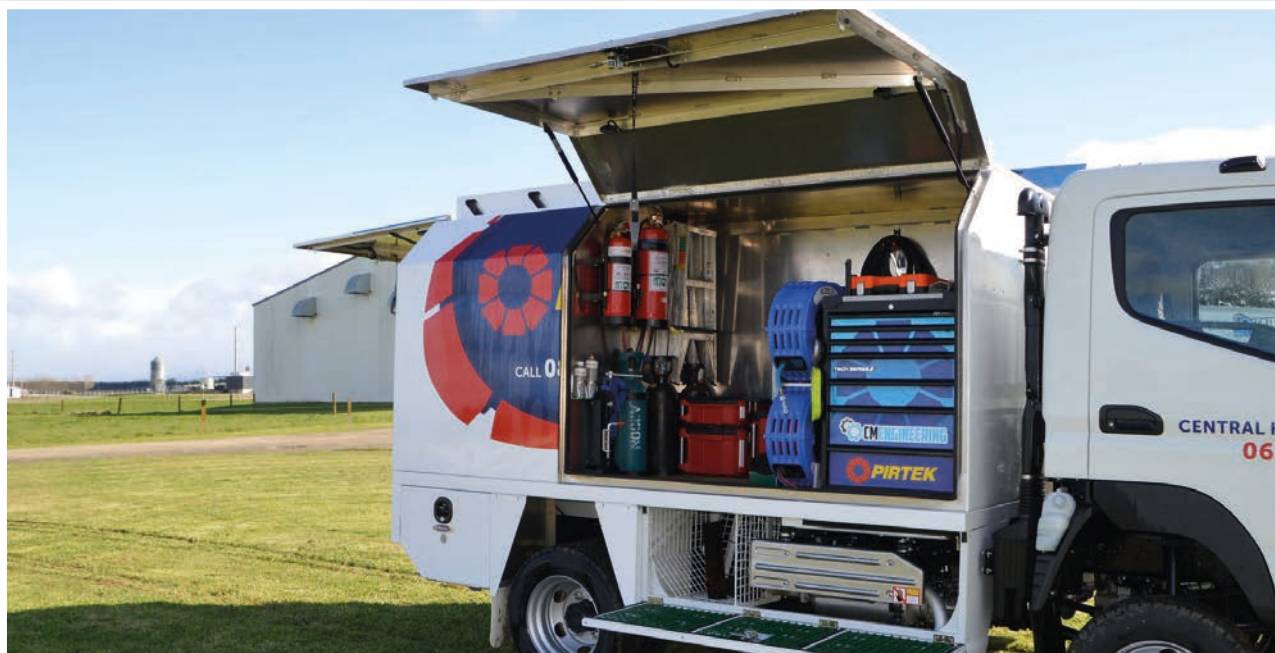
The finished MSU truck showcasing its large storage capacity for the team's parts and tools required on a job.

The completion of the MSU truck project has had a significant positive impact on Pirtek CHB's operations. The newly designed 4WD truck with its custom-built body has enabled the company to cover a larger land area efficiently. The storage capacity, equipped with strategically placed compartments and toolboxes, has ensured that the team had all the necessary parts and tools readily available. This has not only improved service response times but also projected a professional image of the company whilst out on jobs.