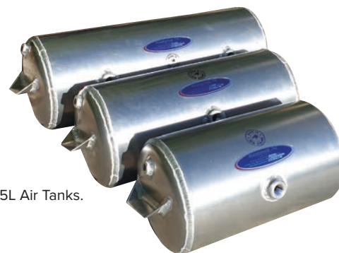
40L, 32L and 25L Air Tanks.

*Note all lengths include Mounting Brackets which are 50mm each end.