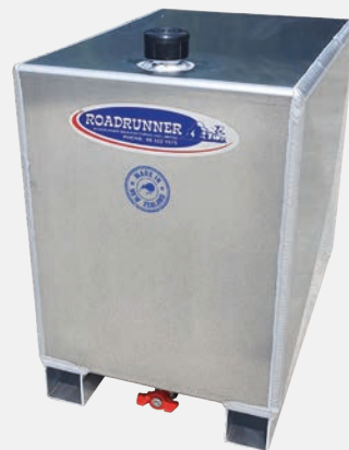
Customised Water Tank.