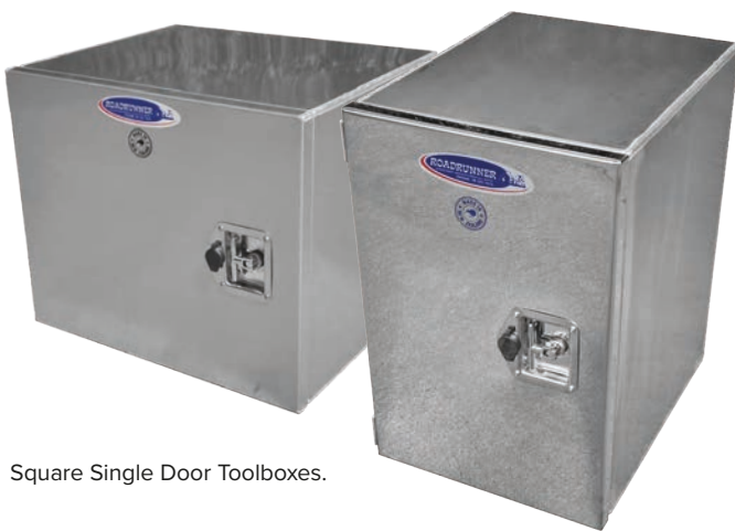
Square Single Door Toolboxes.