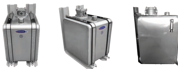
Square Hydraulic Tanks with single mount brackets and stainless steel straps.